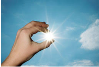
Supplement with Vitamin D3 by Shaklee