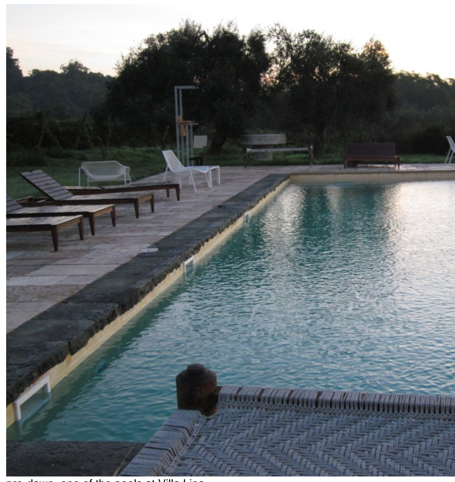
pre-dawn, one of the pools at Villa Lina

3) diet is the hardest. At the Villa our food was incredible, but still not enough vegetables to please me. Or fiber. I bought a package of prunes at a grocery store. Helpful. This is