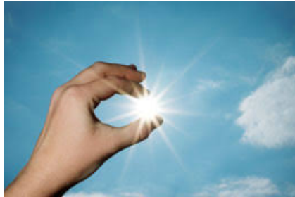
Supplement with Vitamin D3 by Shaklee