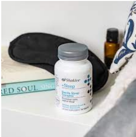
A restful night's sleep.

Minimize disruptions. Even if you go to bed early, frequent interruptions can keep you from enjoying the four essential stages of sleep. The deeper stages of non-rapid eye movement sleep are especially beneficial for your heart. In addition, continuous sleep keeps your heart rate from spiking each time you wake up.