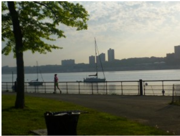
New York's back yard, walking along the Hudson