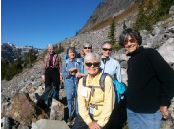
Women on Wed.hike to Red Pass on the Pacific Crest Trail

In my pack I carry a tape made by a German company. The product is called Hansaplast and is not available in the US, only Canada and Mexico in North America. But of course anywhere in Europe you can purchase rolls of this magical thin, easy-to-tear-with-your-fingers tape. If I'm not going to Europe, I ask a traveling friend to buy it for me. Usually I put a piece of this tape on the areas of my feet most likely to blister in my hiking boots before I begin the hike . Usually, if I feel a hot spot, the way I did when we hiked out of Commonwealth Basin up the Pacific Crest Trail toward Red Pass, I stop on the trail and take off my boots and sox and put the tape on, thus preventing a blister. But on Rattlesnake Ridge, I ignored everything I usually do.