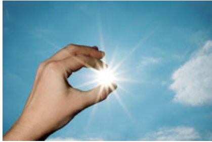
Supplement with Vitamin D3 by Shaklee