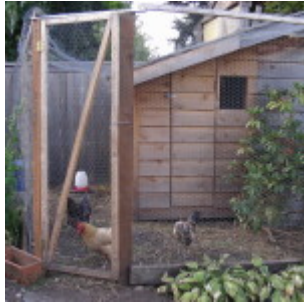
Waldorf Astoria for hens Lean-to with wire enclosure

I construct a wire enclosure alongside the hen house within the raccoon proof run. Three days in a row, like Houdini, she finds an opening and returns to the nesting platform. I put a playpen up on the other side of the garden, put water and food on the gravel, cover it with chicken wire and shake shingles to keep her dry. An unbelievable wailing and gnashing of hen's beaks ensues as the three hens call to each other across the garden. At the end of the week, I pick Cana up and return her to the hen enclosure. Red (the top hen, a Rhode Island Red) attacks her with talons and beak,