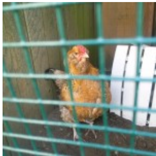
Cana the broody hen keeps escaping her enclosure

I construct a wire enclosure alongside the hen house within the raccoon proof run. Three days in a row, like Houdini, she finds an opening and returns to the nesting platform. I put a playpen up on the other side of the garden, put water and food on the gravel, cover it with chicken wire and shake shingles to keep her dry. An unbelievable wailing and gnashing of hen's beaks ensues as the three hens call to each other across the garden. At the end of the week, I pick Cana up and return her to the hen enclosure. Red (the top hen, a Rhode Island Red) attacks her with talons and beak,